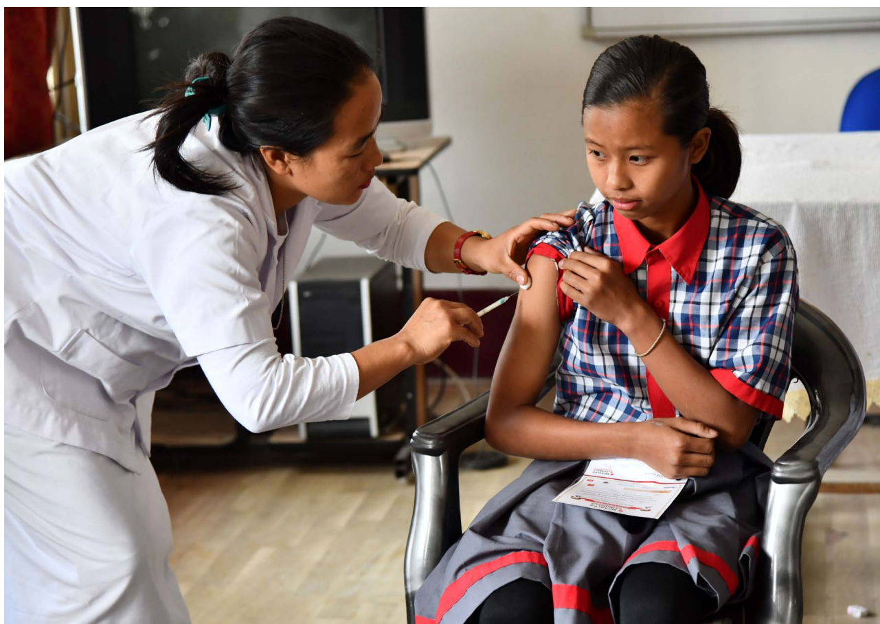
A frontline health worker gives a vaccine to a student during a Measles Rubella vaccination session at Kendriya Vidyalaya School in Pasighat, in India's north-eastern state of Arunachal Pradesh in February 2018.